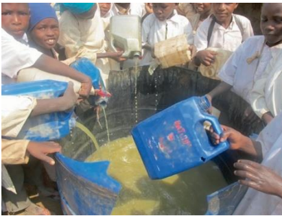
Dirty Drinking Water at a School in Darfur