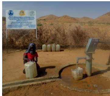
Clean Water Flowing from a Kids for Kids Handpump